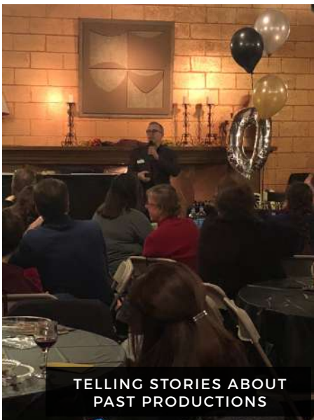
TELLING STORIES ABOUT PAST PRODUCTIONS